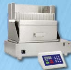
Block Digester BD 50s

Discrete analysis is complementary to segmented flow analysis and many laboratories use both techniques. The AQ2+ is ideal when many and varied tests are needed on different samples.